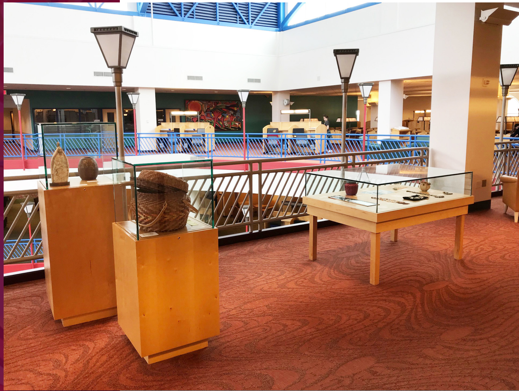
Denison Collection of Native American Art A series of secure cases featuring these artifacts from the Clarke Historical Library's collection.